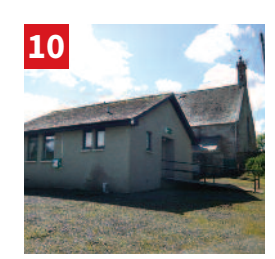
Birse North wall of the hall, adjacent to the church. AB34 5BY