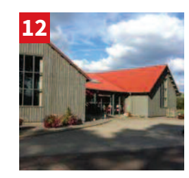
Finzean Front wall of the village hall, main road. AB31 6LY