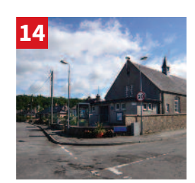
Lumphanan Front wall of the village hall, village centre. AB31 4SE