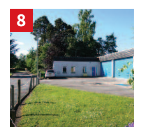
Aboyne The Ambulance Station, Bell Wood Road. AB34 5HQ