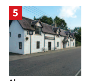
Aboyne Through side gate, off car park. Boat Inn, Charleston Road. AB34 5EL