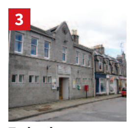
Tarland Front wall of MacRobert Hall, village square. AB34 4YL